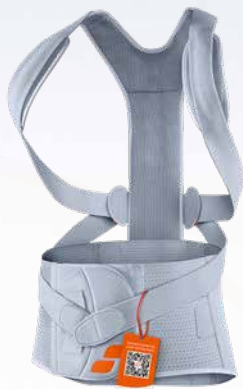
Functional aids and appliances