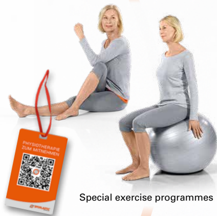
Special exercise programmes