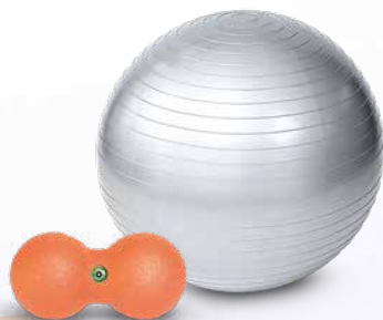
Helpful, tried and tested training equipment