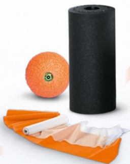
Helpful, tried-and-tested training equipment

instructed exercise videos: access to important information via QR- Code anytime, anywhere