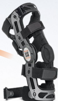
Functional aids and appliances