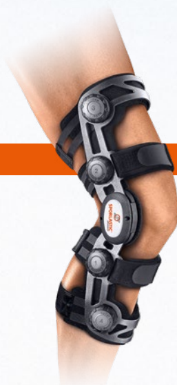
GENUDYN® CI NOVEL