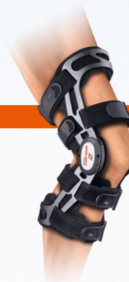
GENUDYN® CI STEP THRU